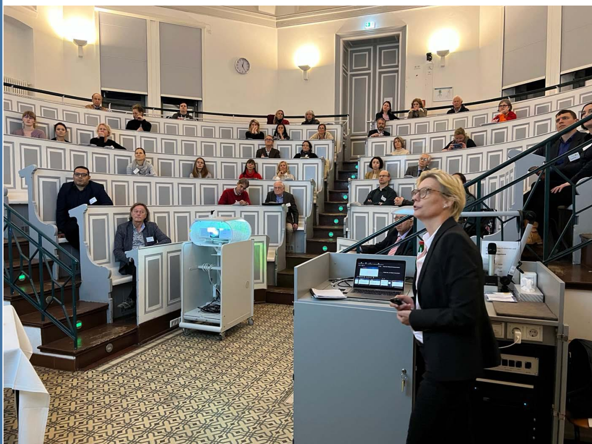
Fig. 1: The lecture hall, a historical anatomic theatre.